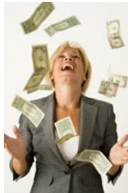
Small Business Loans Are Becoming Less and Less Popular

“Funding new growth for individual business's in the past has mostly been handled by bank loans and small business loans requiring lengthy application procedures and mostly weighed down with high interest rates and penalties...”